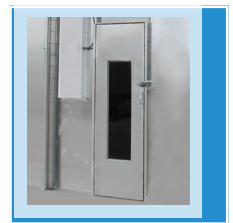
Windowed personnel access doors