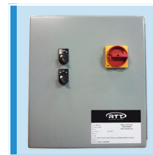
Optional UL & ETL listed control panel