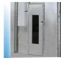
Windowed personnel access doors