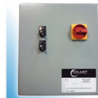
UL & ETL listed control panel